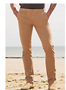
SOL'S JULES MEN - LENGTH 35 02120