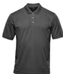
M's & W's: Dolphin