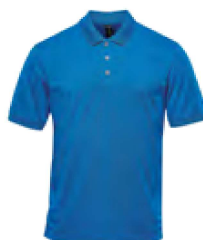
M's & W's: Azure Blue