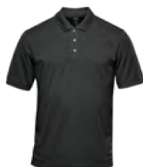
M's & W's: Black