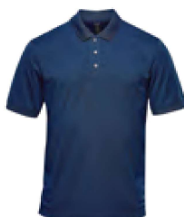
M's & W's: Navy