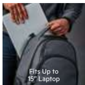
Fits Up to 15" Laptop