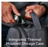
Integrated Thermal Moulded Storage Case