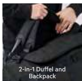
2-in-1 Duffel and Backpack