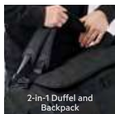
2-in-1 Duffel and Backpack