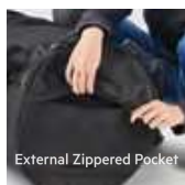
External Zippered Pocket