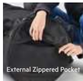
External Zippered Pocket