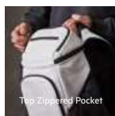
Top Zippered Pocket