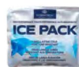
ICE-1 MSRP $6.00