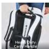
Heavy Duty Carry Handle