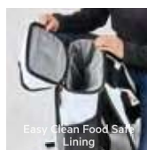
Easy Clean Food Safe Lining