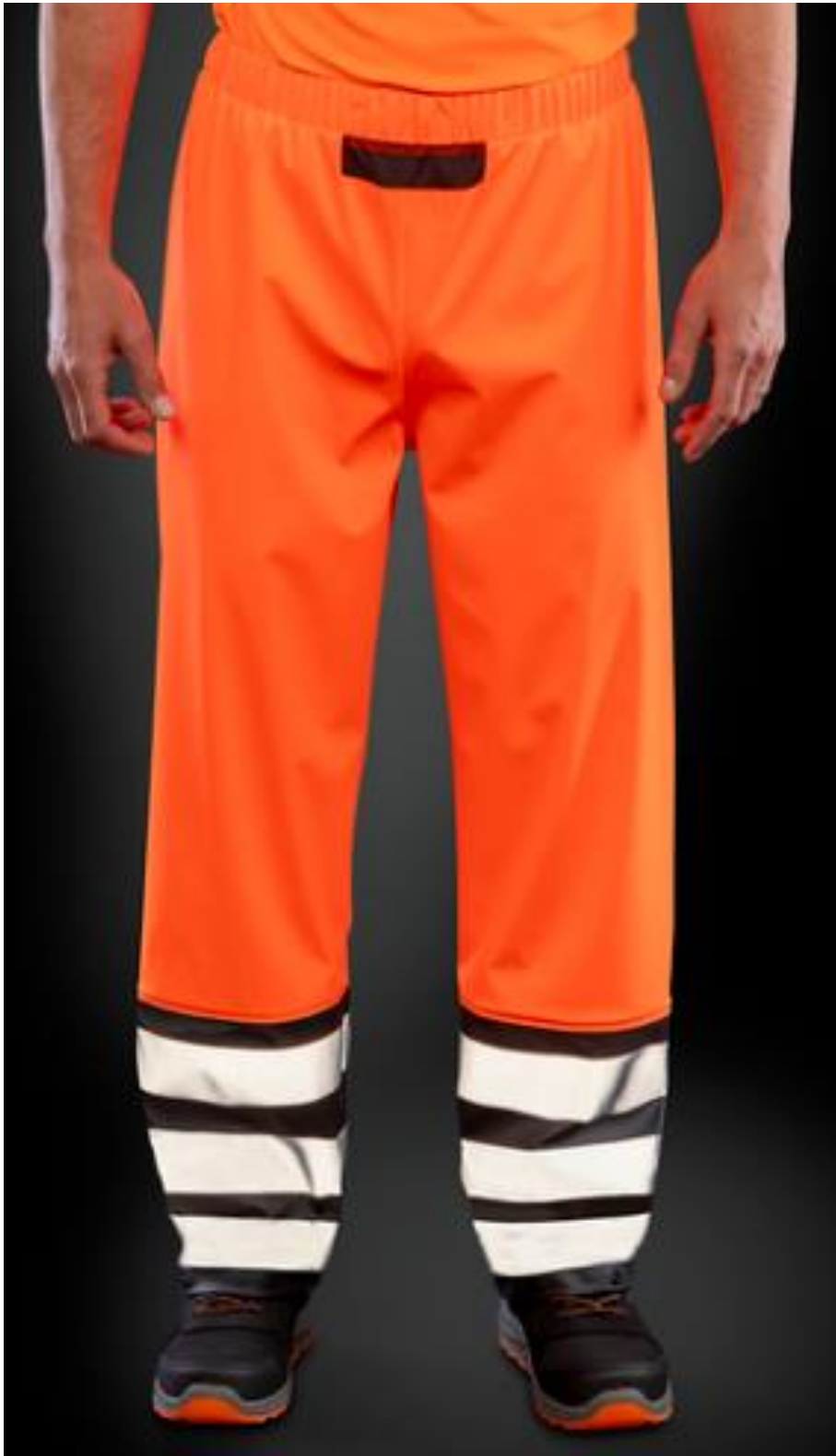
R508X HEAVY DUTY PRISM PU WATERPROOF SAFE & DRY TROUSER with RECYCLED BACKING