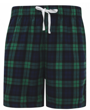
NAVY GREEN CHECK 655C/349C