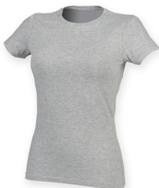
Heather Grey 34% Black