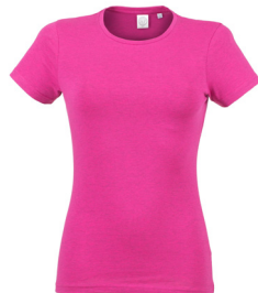
Heather Pink 682C