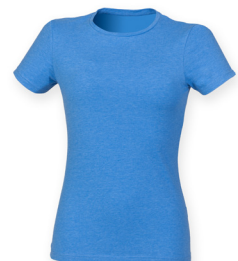
Heather Blue 2727C